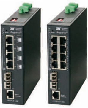
SFPs not included

The RuggedNet compact industrial PoE Ethernet switches can be wall or rack mounted using a wall mount bracket and shelf or DIN-rail mounted using the included DIN-rail mounting clip. They are available with dual DC input power.